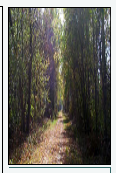
The WIOUWASH Trail between Breezewood Lane and

"Shall you cry because the rose has a thorn; or rejoice because the thorn has a rose?"